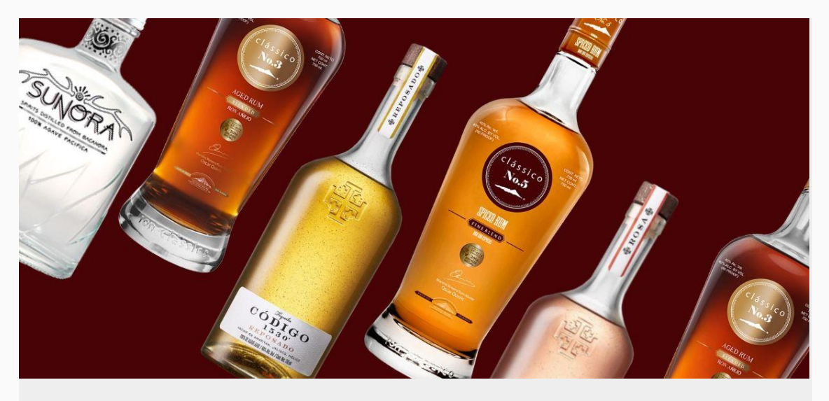
Winners at 2019 Bartender Spirits Awards

U.S. bar trade. <u>The judging panel</u> consists of some of the most renowned names in the U.S. bar industry, all of them with extensive expertise within the on-premise industry.